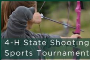
4-H State Shooting Sports Tournament